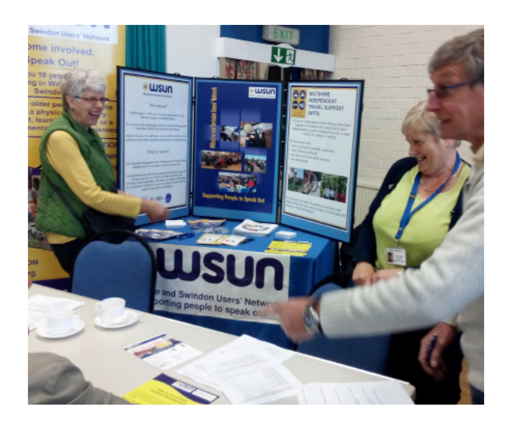
CRG at Cricklade

Members were also involved in the recent re-tendering of the HTL@H service. Three people took part in the evaluation of the tender applications with a further two being involved in the presentations.