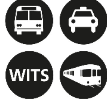
The route to independent travel

In April, we were delighted to be awarded a contract by Bath and North East Somerset Council to supply travel training to their young people with learning disabilities or other complex needs. This is as a result of the support we have provided to BANES on an individual basis over the past two years.