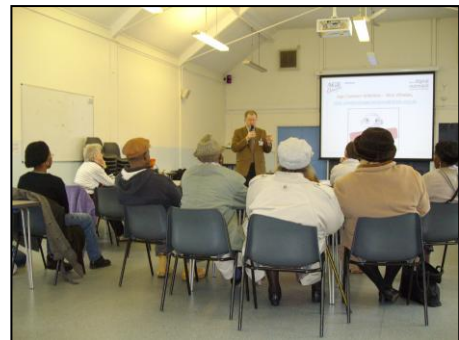
Digital Switchover Event